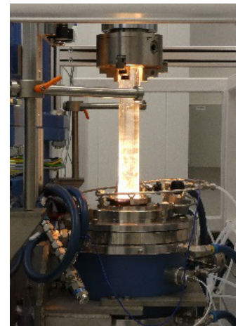
Figure 2: An impression of the fiber draw tower at HITec.